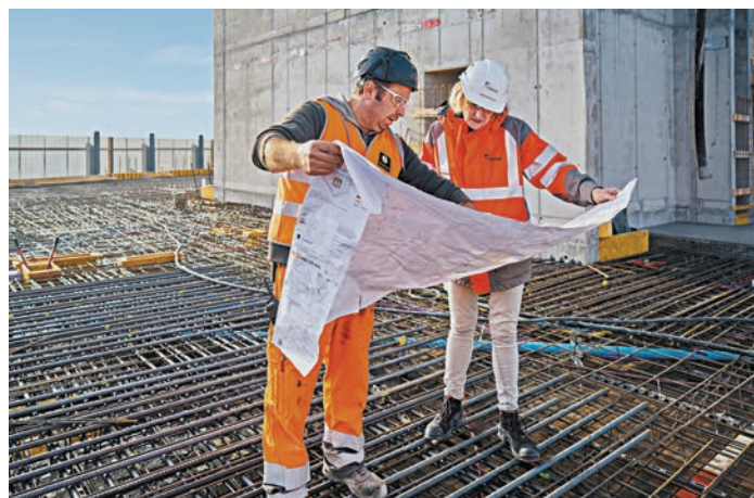
The non-GAAP measures used in this report are defined on page 30.

Notes. Recurring EBITDA excludes restructuring, litigation, implementation and other non-recurring costs. Recurring EBITDA growth and Net Sales growth are both presented on a like-for-like basis.