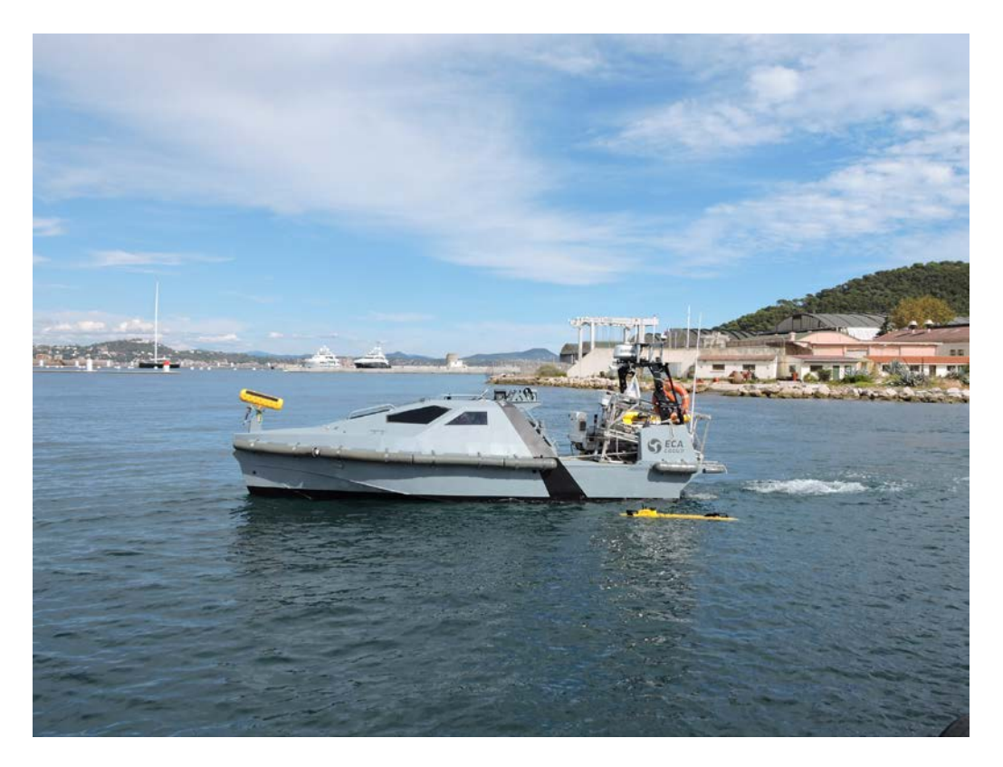
ECA Group: Unmanned MCM System