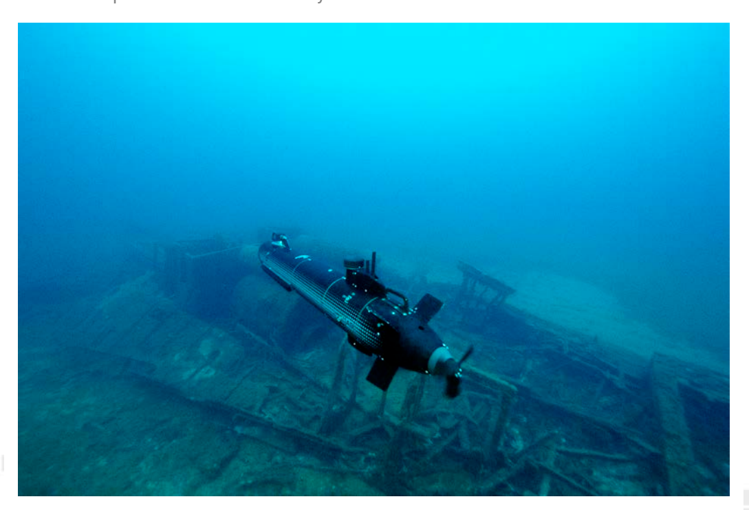
ECA Group: AUV 9-M