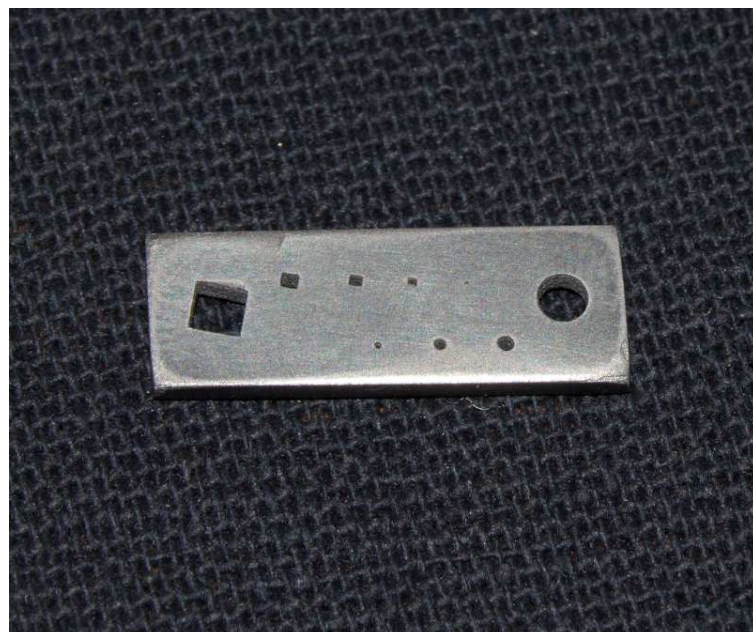
Sample of a metal part printed using the Prodways© R&D technology

The Prodways R&D teams have been collaborating with CEA-LITEN for two years. This collaboration with this institute of CEA – CEA Tech - is working on a new metal 3D printing process using metal powder combined with organic binders. This project has just seen its first successful production of titanium parts using this new exclusive process: