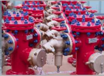
Industrial Projects and services