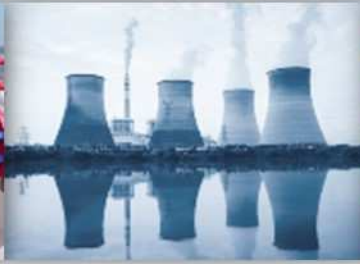
Protection in Nuclear Environments