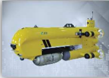
Smart Safety Systems