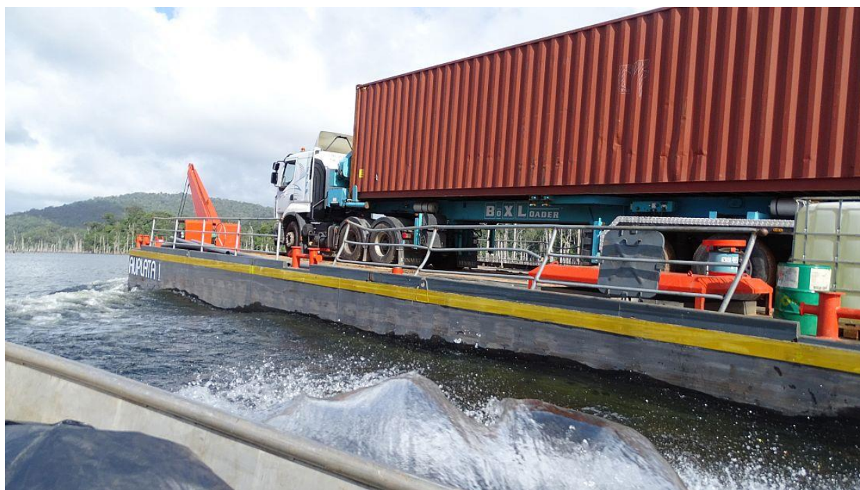
Container on the Auplata barge crossing the lake of Petit Saut dam

Module assembly will begin in April 2018, supervised by SGS Bateman. Auplata expects to have the plant operational by the 3 rd quarter of 2018.