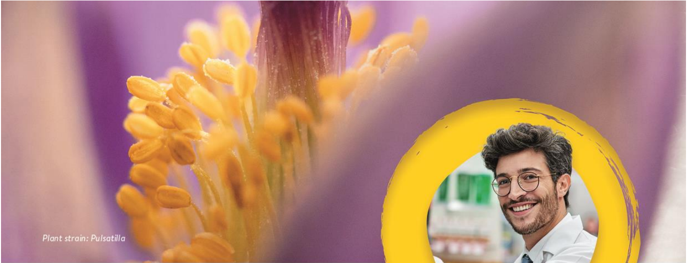
Plant strain: Pulsatilla