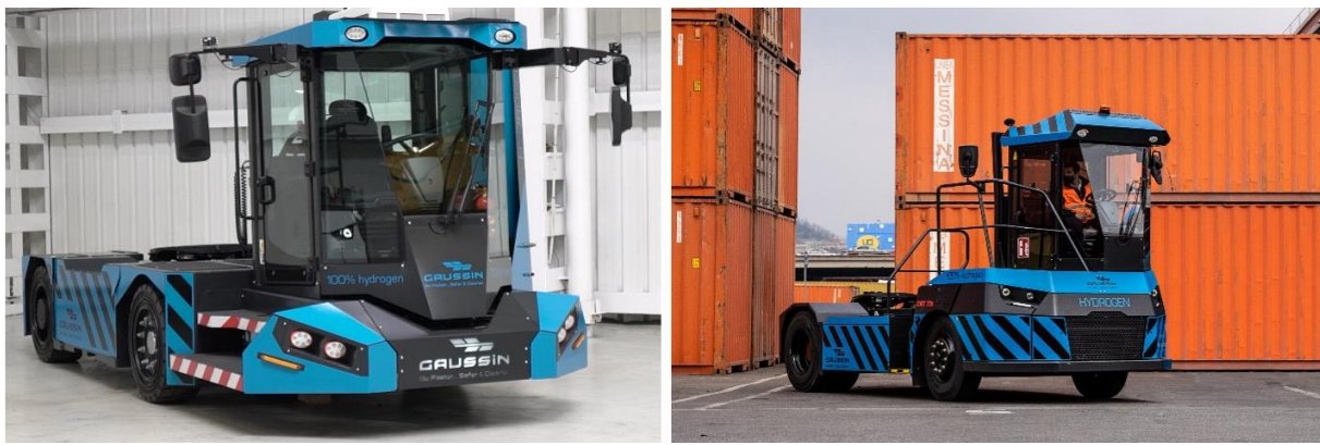
The ATM®-H2 (left) and the APM®-H2 (right), two emblematic GAUSSIN hydrogen vehicles

Lhyfe's business is thus complementary to that of GAUSSIN, which designs heavy handling vehicles running on hydrogen. Aware of the possible synergies between their areas of business, Lhyfe and GAUSSIN wish to offer a global green hydrogen mobility solution for the transport and logistics ecosystem.