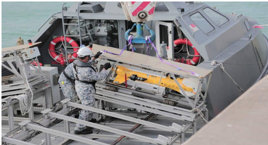
K-STER drone integrated into the USV of the Singapore navy

Beyond the Republic of Singapore Navy, other commercial processes are underway in the Asia-Pacific region for robotic mine countermeasure systems. Negotiations are progressing and could lead to short-term notifications.