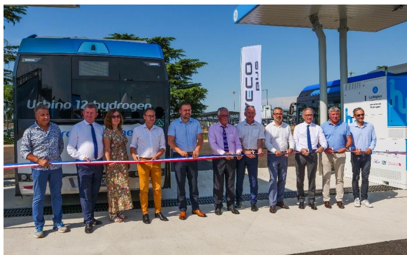
Station inaugurated by the Auvergne-Rhône-Alpes Region and HYmpulsion shareholders (ENGIE, Michelin, Banque des Territoires, and Crédit Agricole) in partnership with Aéroports de Lyon.

Grenoble, July 3 2025 - HRS , a French designer and manufacturer and European leader in hydrogen refueling stations, announces that its HRS40 station (capacity of 1 ton per day), installed near Lyon-Saint-Exupéry Airport (Rhône, France) on behalf of its customer HYmpulsion, was inaugurated on Monday, June 30, 2025.