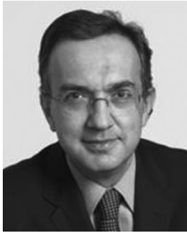
Sergio Marchionne Chief Executive Officer, Fiat S.p.A., Italy Director since 2008 Age: 56

Mr. Marchionne has been Chief Executive Officer of Fiat S.p.A. since June 2004, on whose Board of Directors he has served since May 2003. He is also Chief Executive Officer of Fiat Group Automobiles S.p.A., Fiat's car division, since February 2005 and Chairman of CNH Case New Holland, Fiat's agricultural and construction equipment division, since April 2006 and a director since July 2004. Mr. Marchionne has been a member of the Board of SGS S.A. since May 2001, serving as the Chief Executive and Managing Director from 2002 to 2004 and became Chairman in March 2006. Mr. Marchionne has been a member of the Board of Directors of UBS since April 2007 and, in 2008, he was appointed non-executive Vice Chairman and Senior Independent Director. He is also a member of the Board of Directors of ACEA (European Automobile Manufacturers Association), which he Chaired in 2006 and 2007, General Councils of Confindustria and Assonime, and a permanent member of the Fondazione Giovanni Agnelli. Mr. Marchionne is a chartered accountant and lawyer who, since beginning his career in 1983, has held executive positions at several firms prior to assuming his current positions. Mr. Marchionne serves on the Audit, Compensation and Leadership Development and Nominating and Corporate Governance Committees.