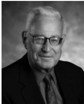
Harold Brown Counselor, Center for Strategic and International Studies, Washington, DC Director since 2008 Age: 82

Although it is not anticipated that any of the persons named below will be unable or unwilling to stand for election, a proxy, in the event of such an occurrence, may be voted for a substitute designated by the Board. However, in lieu of designating a substitute, the Board may amend the Company's By-Laws to reduce the number of directors.