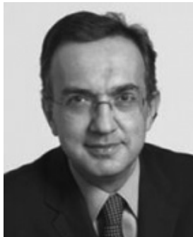
Sergio Marchionne Chief Executive Officer, Fiat S.p.A., Italy Chief Executive Officer, Chrysler Group LLC Detroit Director since 2008 Age: 57

Mr. Marchionne has been Chief Executive Officer of Fiat S.p.A. since June 2004, on whose Board of Directors he has served since May 2003. He is also Chief Executive Officer of Fiat Group Automobiles S.p.A., Fiat's car division, since February 2005 and Chairman of CNH Case New Holland, Fiat's agricultural and construction equipment division, since April 2006 and a director since July 2004. He was named Chief Executive Officer of Chrysler Group LLC in June 2009. Mr. Marchionne has been a member of the Board of SGS S.A. since May 2001, serving as the Chief Executive and Managing Director from 2002 to 2004 and became Chairman in March 2006. From 2006 to 2007, Mr. Marchionne was a member of the Supervisory Board of Hochtief AG. Mr. Marchionne has been a member of the Board of Directors of UBS since April 2007, and will be stepping down from the UBS Board on April 14, 2010. Mr. Marchionne is a chartered accountant and lawyer who, since beginning his career in 1983, has held executive positions at several firms prior to assuming his current positions. Mr. Marchionne serves on the Audit, Compensation and Leadership Development and Nominating and Corporate Governance Committees.