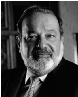
Carlos Slim Helú Chairman of Impulsora del Desarrollo y el Empleo en América Latina, S.A.B. de C.V. Chairman, Carso Infraestructura y Construcción, S.A.B. de C.V. Director since 2008 Age: 70

Mr. Slim is currently serving as Chairman of Impulsora del Desarrollo y el Empleo en América Latina, S.A.B. de C.V. and Carso Infraestructura y Construcción, S.A.B. de C.V. Mr. Slim previously served as Chairman Emeritus of Grupo Carso, S.A. de C.V. (1) as well as Chairman of Teléfonos de México, S.A. de C.V. and Carso Global Telecom, S.A. de C.V., México. Previously and from 1991, he was Chairman of Grupo Carso, S.A. de C.V. From 1997 to 2006, Mr. Slim served as a director of Altria Group, Inc. Mr. Slim served as Chairman Emeritus of Grupo Financiero Inbursa, S.A.B. de C.V. from 2004 to 2007. He also serves as Chairman Emeritus of America Movil, S.A. de C.V. since September 2005. Mr. Slim is a member of each of the Advisory Council for Latin America of the New York Stock Exchange and the board of Fundación Unam A.C. and Patronato del Hospital Infantil. He is also Chairman of Fundación Telemex, A.C. and Fundación Carlos Slim, A.C. Mr. Slim serves on the Finance and Product Innovation and Regulatory Affairs Committees.