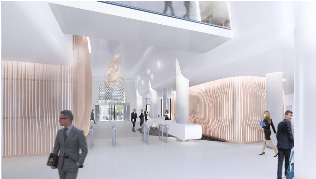
The Friedland entrance lobby project