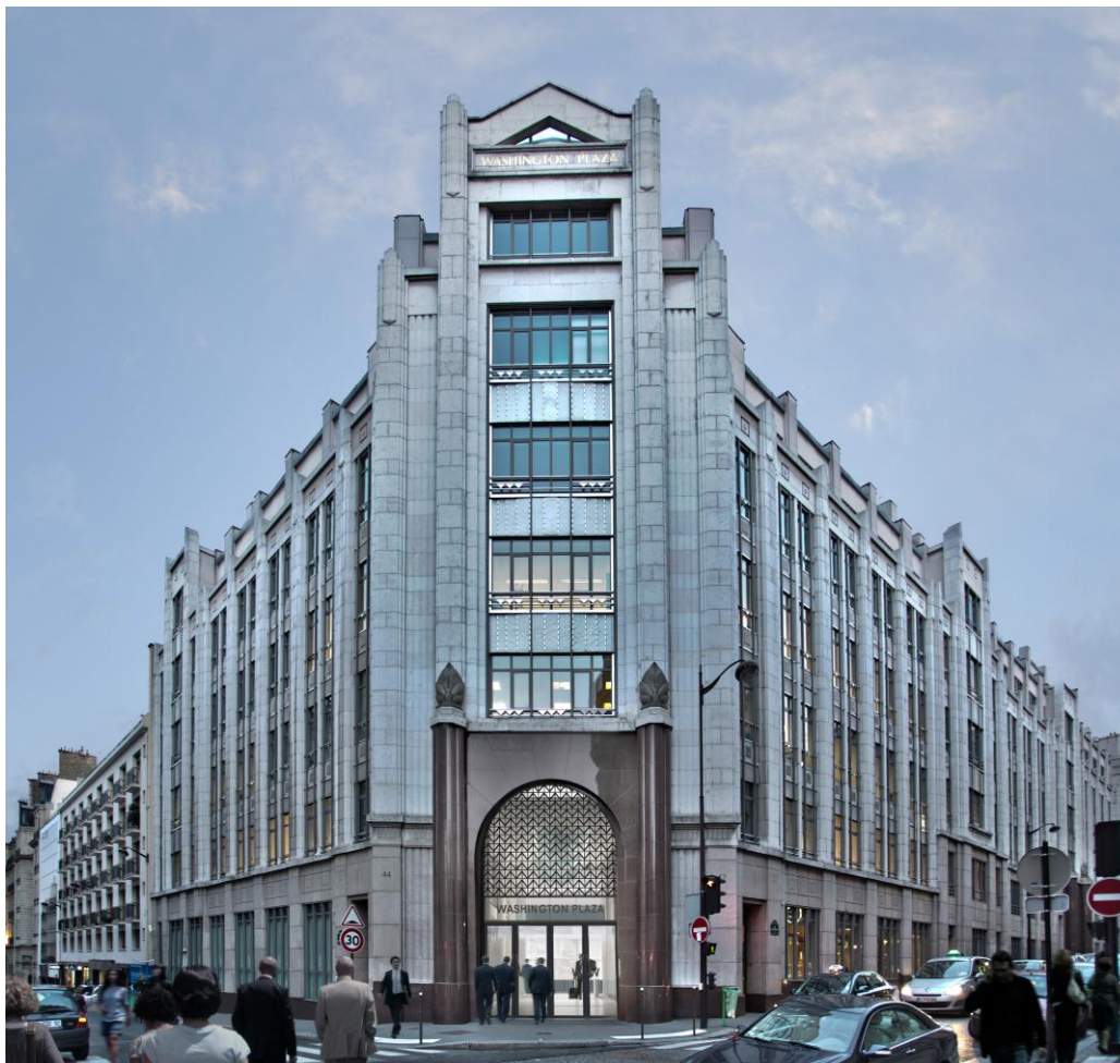
The new Washington Plaza