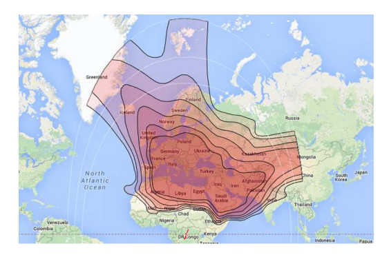
EUTELSAT 21B Widebeam

Vizocom's new AfricAsia Satellite Services will take advantage of two high-power service areas of the EUTELSAT 21B satellite to offer connectivity with speeds ranging from 6Mbps to 10 Mbps in the Middle East and Africa.