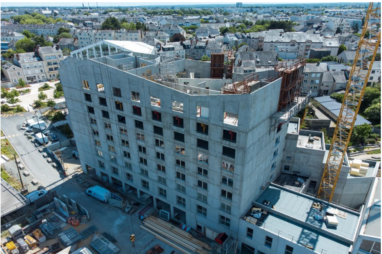
The Skyline residence in Angers built with H-UKR clinker-free concrete

Following these tests that have proved more than conclusive, the two companies have decided to accelerate their collaboration through the signing of a partnership contract with volume commitments that includes Hoffmann's entire cement range: H-EVA, H-UKR and H-IONA. Hoffmann Green will supply its 0% Clinker decarbonised concrete to Bouygues Immobilier as of this year for the realisation of a number of large-scale construction projects throughout France.