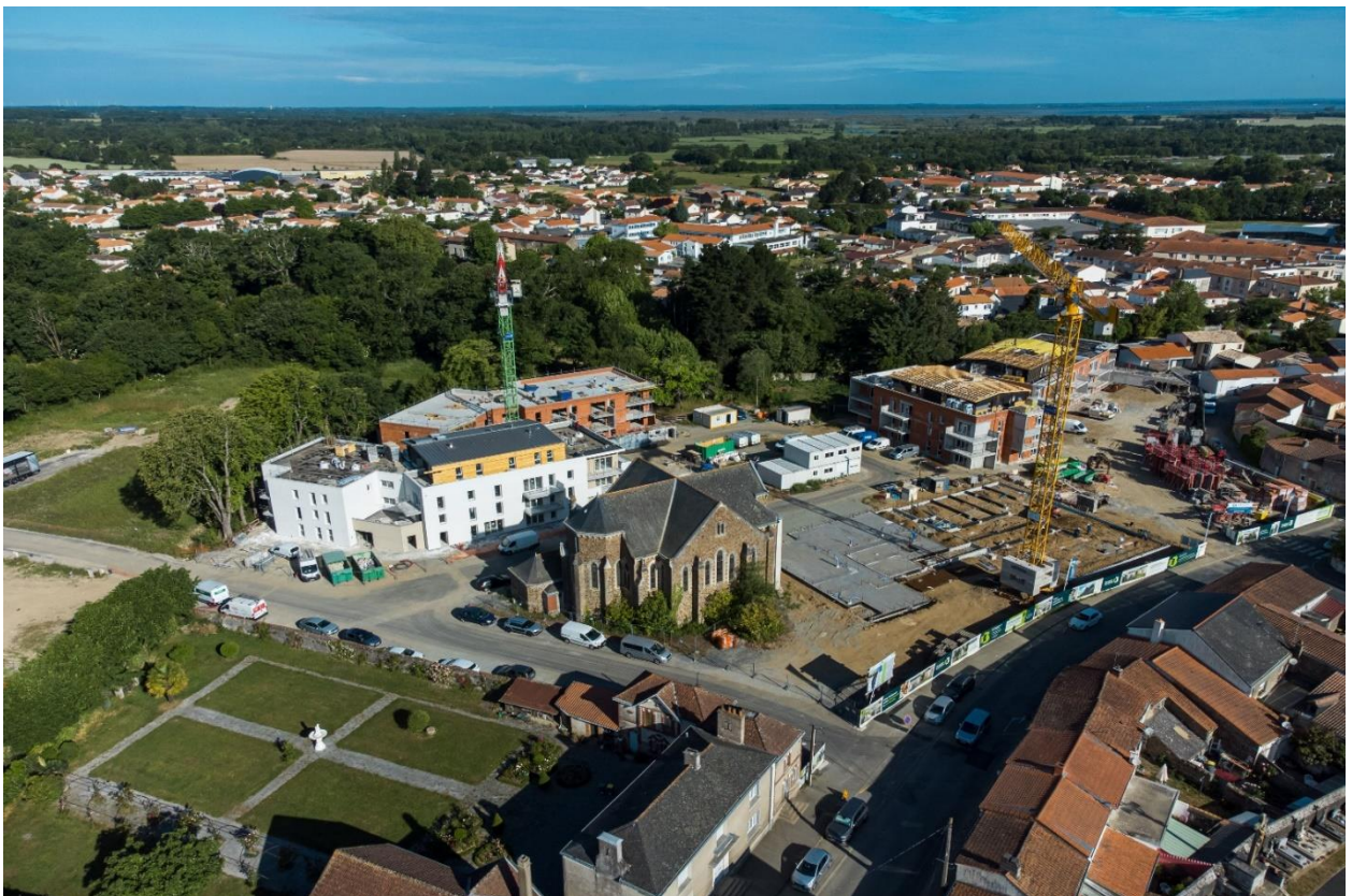
Drone view of the Clos Saint-François site in Saint-Philibert de Grand Lieu