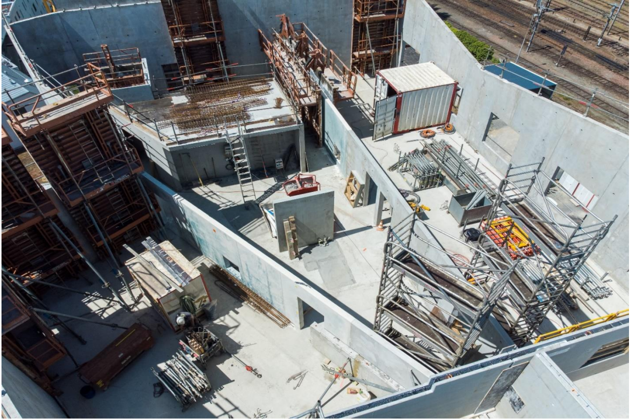
Pouring of HOFFMANN 0% Clinker Carbon Free Concrete on the SKYLINE site in Angers