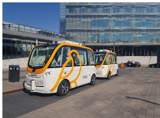
NAVYA shuttle trial in Copenhagen