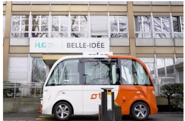
NAVYA shuttle trial in Genève