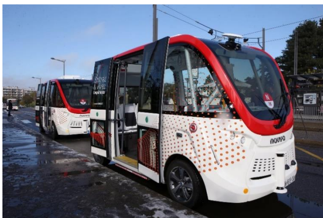
NAVYA shuttle trial in Lyon

Within the project, ten NAVYA shuttles underwent trials in four European cities: Lyon, Luxembourg, Geneva and Copenhagen.