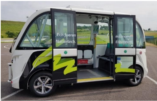
NAVYA shuttle trial in Luxembourg