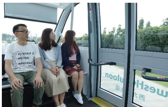
Naveya shuttle at the West Kowloon Cultural District (WKCD)