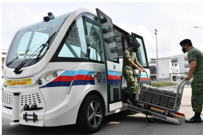
Navya Autonom shuttle, being used on military site, for goods and people transportation

Up to day, a total fleet of 10 Autonomous shuttles has been used on the multiple military sites, to cover mobility needs.