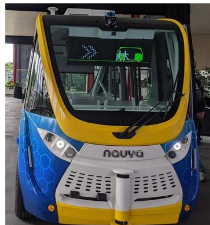
Opening ceremony for the first NAVYA shuttle in Indonesia