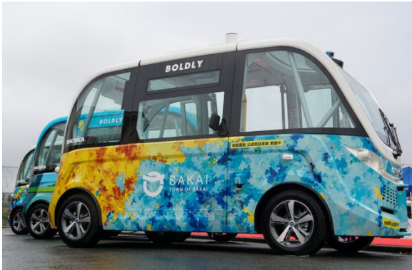
Sakai-Machi site in Japan