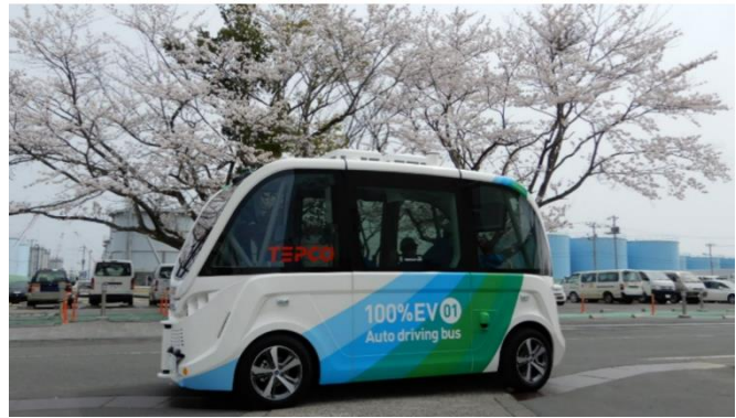
TEPCO Fukushima site in Japan