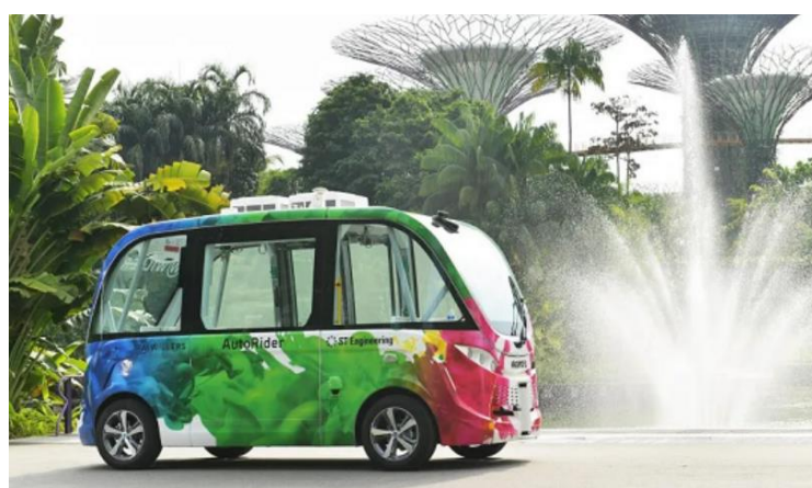
Navya Autonom shuttle, customized with digital-glass technology and lighting effects at Gardens by the Bay