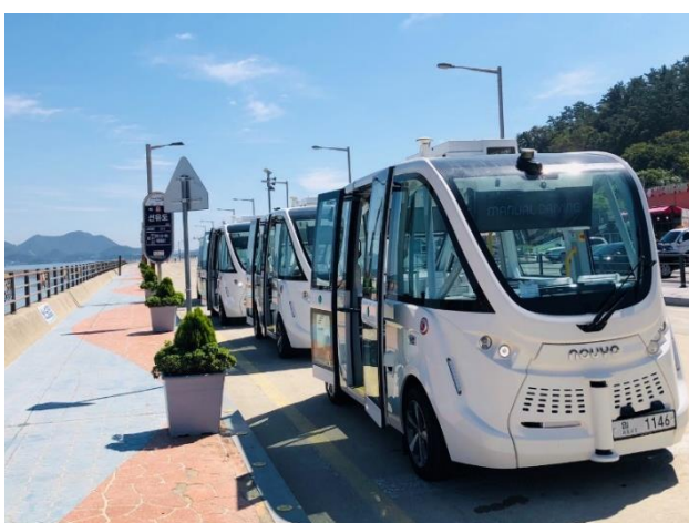
Gunsan site from SpringCloud in Korea

Spring Cloud Co., Ltd recently immersed Navya's shuttle passengers into the metaverse by offering a unique virtual reality experience during their ride. The project was presented at the Yeosu Expo 2022 on March 25th, with the aim of offering ever more technologies and innovations for the comfort and the well-being of passengers, while providing new autonomous mobility opportunities for an ever more connected and attractive user experience.