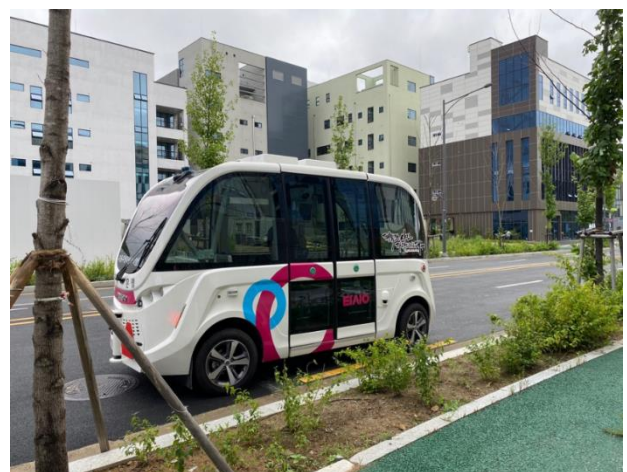
Daegu site from SpringCloud in Korea