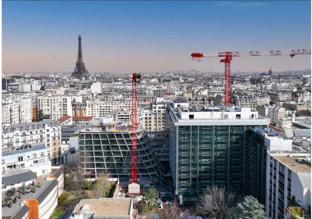
Biome – Paris 15