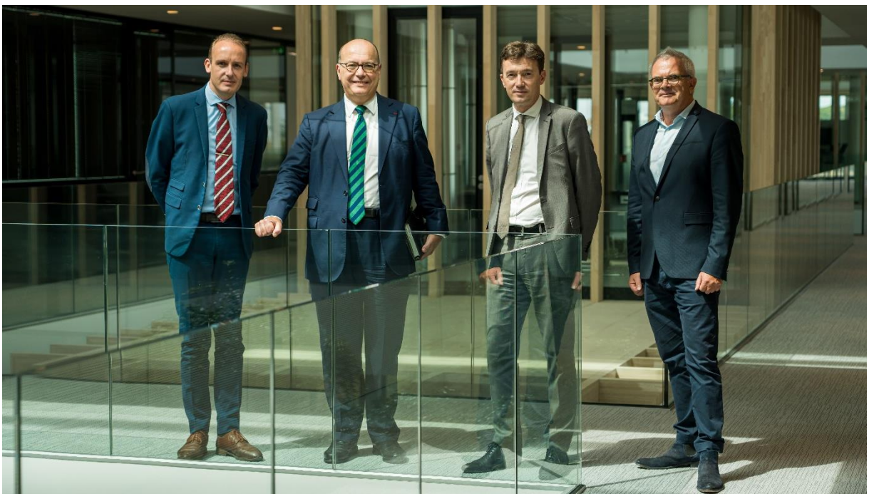
The management teams of Hoffmann Green and Les Maçons Parisiens

From 2022 and over the next three years, Hoffmann Green will deliver to Les Maçons Parisiens its clinker-free H-IONA and H-UKR cements for the construction of collective buildings in the Île-de-France area. The use of Hoffmann Green cements by Les Maçons Parisiens will drastically reduce the carbon footprint of future buildings such as housing, office buildings, public facilities, hospitals, clinics, homes for the elderly, social residences, etc.