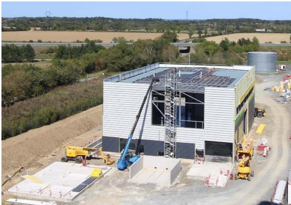
Isover pilot installation

Concrete pours made with Hoffmann Green H-UKR cement are proliferating and are currently being used by Eiffage Génie Civil teams for the construction of the foundations of a prototype workshop of the Isover company located in Chemillé-en-Anjou (Western France). Following on from its Isover Recycling offer, the world's first offer to recycle used glass wool from buildings, the company is stepping up its development in favor of a circular economy in the building industry. It has begun work on the low-carbon footprint industrial prototype dedicated exclusively to glass wool recycling. With commissioning scheduled for 2023, this unprecedented pilot facility meets the Saint-Gobain Group's strong ambitions to achieve carbon neutrality by 2050.