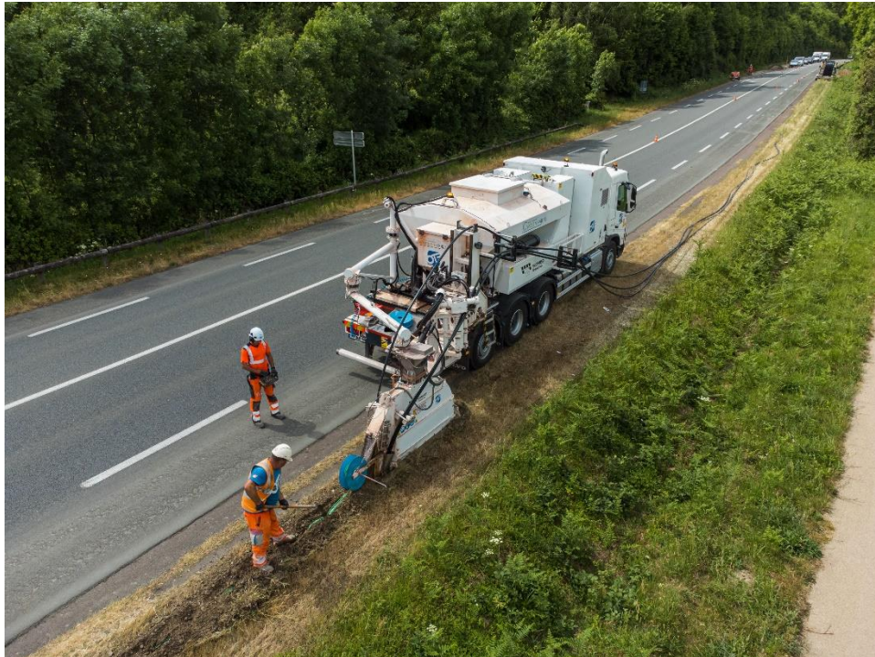
Greenpose solution applied by O.T.E. teams