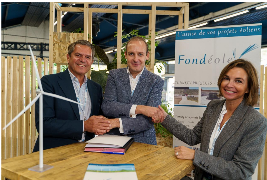
The management teams of Hoffmann Green and Fondéole Group

As a historical player in the wind energy sector and builder of more than 800 wind turbines in 140 wind farms since 2006, Fondéole Group is committed to using and promoting Hoffmann cements in the French wind energy sector. Hoffmann Green and Fondéole Group aim to build 50% of onshore and offshore wind turbine foundations with Hoffmann cements by 2028, which represents approximately 50,000 tons of cement.