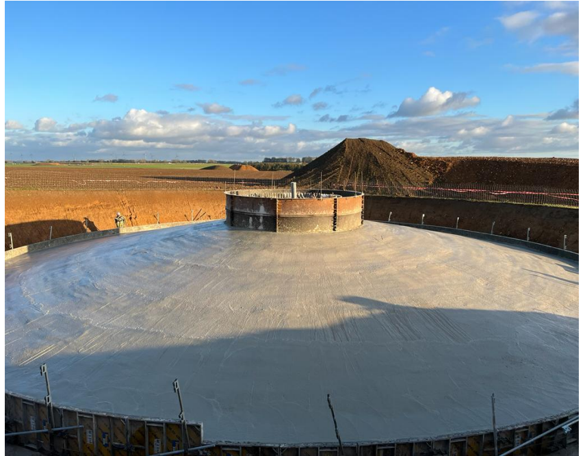
Wind turbine foundations made by Fondéole Group