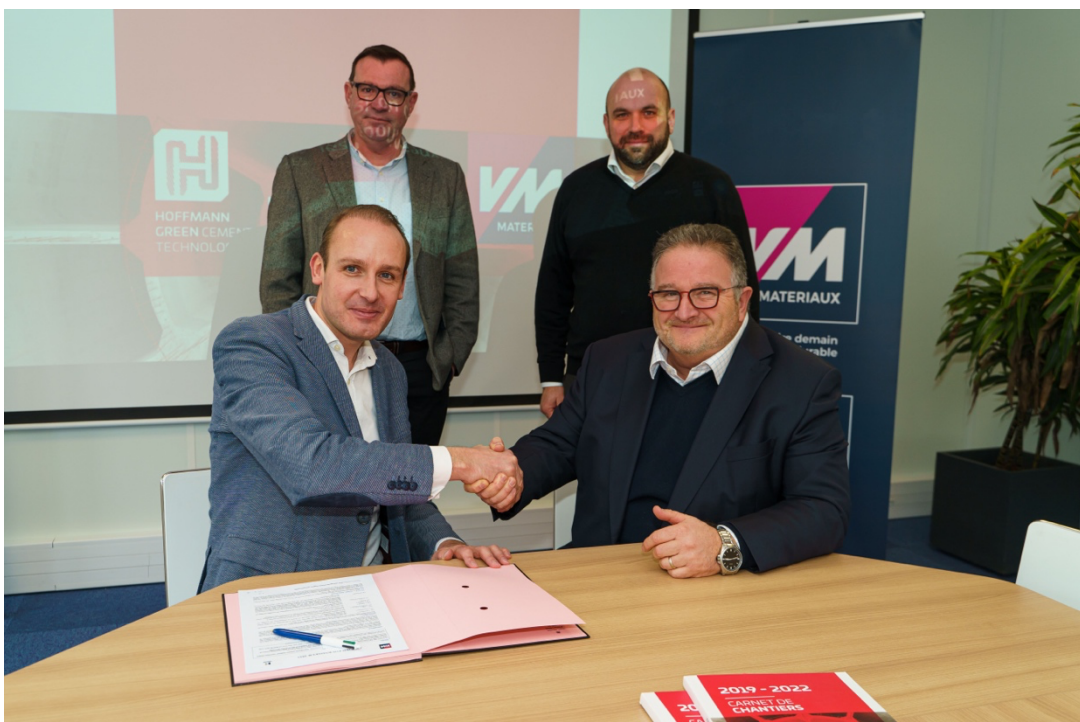
The VM Matériaux and Hoffmann Green management teams

Signed on Monday 30 January, the agreement provides for the partnership to be set up in February.