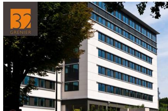
32 Grenier – Boulogne Billancourt