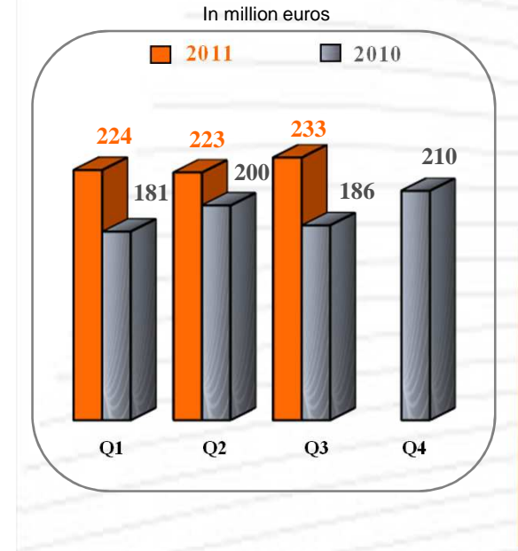
Quarterly Consolidated sales

Demand from Stryker slowing down slightly, confirming the end of the stocking period