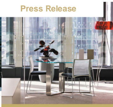
OB 21 – LA DÉFENSE