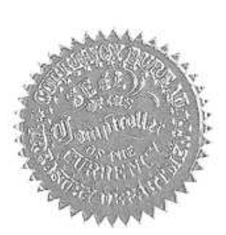
Acting Comptroller of the Currency