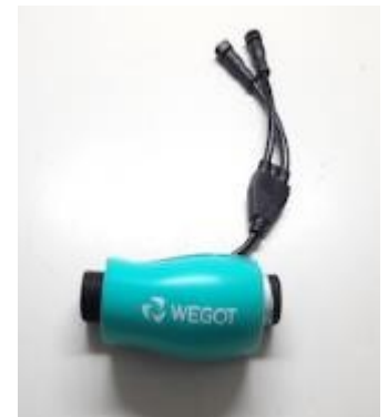
WEGoT Ultrasonic Sensor

WEGoT, which was launched in 2015, calculates that its systems in more than 30,000 homes and 40 million square feet of commercial space have saved more than 3 billion liters of water. With a goal of saving another 10 billion-plus liters in the next three years, WEGoT and Kerlink plan to deploy the system in a million more homes and more than 5,000 commercial and industrial facilities by 2024.