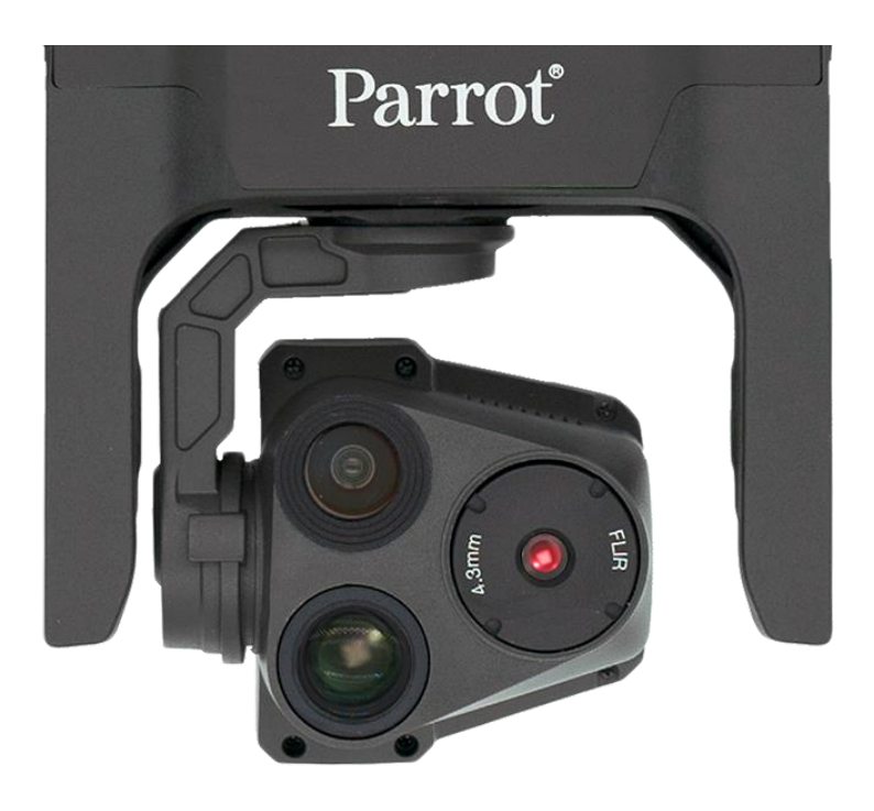
ANAFI USA's stabilized triple camera.

When firefighters arrive on the scene of a fire, the most important need is to view hot spots while also being able to assess the entire visual scene. ANAFI USA's gimbal and advanced optics were designed with this challenge in mind. The 32x zoom is designed around two 21-megapixel cameras, allowing operators to see details clearly from up to 5 km (3.1 mi) away.