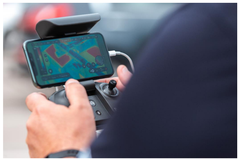
FreeFlight 6, a valuable assistant for pilots and their teams

ANAFI USA captures the precise GPS coordinates of the drone and the point of interest, offering detailed location information to help operation leaders on the ground quickly locate targets such as missing persons or hazardous materials.