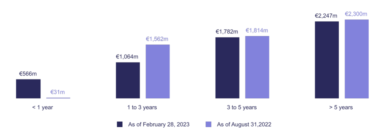
Chart also available on https://www.sodexo.com/en/investors/financial-results-and-publications/financial-results - Sodexo H1 Results FY23 - Slide n° 44

Sodexo - First half Fiscal 2023 results 44/52