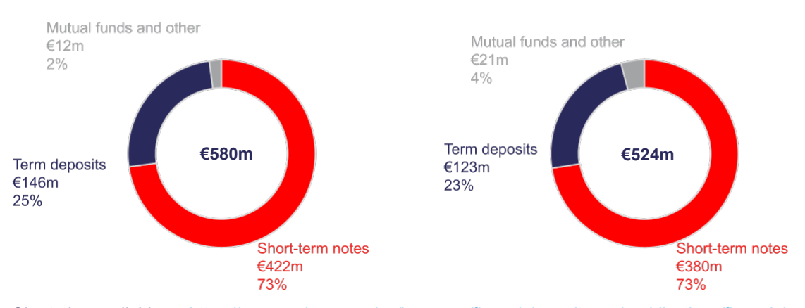
Chart also available on https://www.sodexo.com/en/investors/financial-results-and-publications/financial-results - Sodexo H1 Results FY23 - Slide n° 47