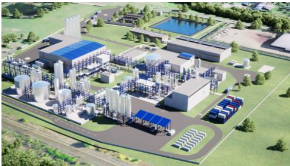
Figure 3: 3D modelling of CARBIOS' first commercial PET biorecycling plant in Longlaville, France, currently under construction with a capacity of 50 kt/year.

CARBIOS' technology enables PET circularity and provides an alternative raw material to fossil-based monomers, giving PET producers, waste management companies, public bodies and brands an effective solution to meet regulatory requirements and their own commitments to sustainable development. The plant will have the capacity to process 50,000 tons of prepared PET waste per year (equivalent to 2 billion colored bottles, 2.5 billion food trays or 300 million T-shirts). The plant will create 150 direct and indirect jobs in the region. In October 2023, CARBIOS obtained the building and operating permits for the site. The factory is currently under construction on land officially acquired from Indorama Ventures on 14 February 2024. In February 2024, CARBIOS and De Smet Engineers & Contractors (DSEC) announced their collaboration to manage construction. Several