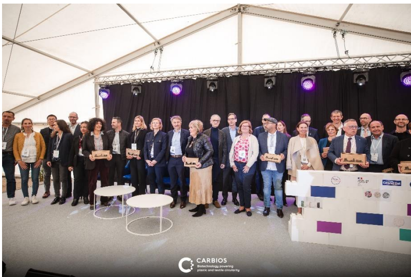
Figure 2: CARBIOS and representatives of local authorities, partner brands and industrial partners celebrate the groundbreaking ceremony for the world’s first PET biorecycling plant.

Franck Leroy, President of Région Grand-Est : « I’m proud to support the deployment of the world’s first plant dedicated to the biorecycling of PET. CARBIOS is a perfect illustration of our vision of modern, responsible re-industrialisation, placing the Grand Est region at the heart of the ecological transition. This key innovation in the fight against plastic pollution will also create 150 jobs in the Longlaville area. »