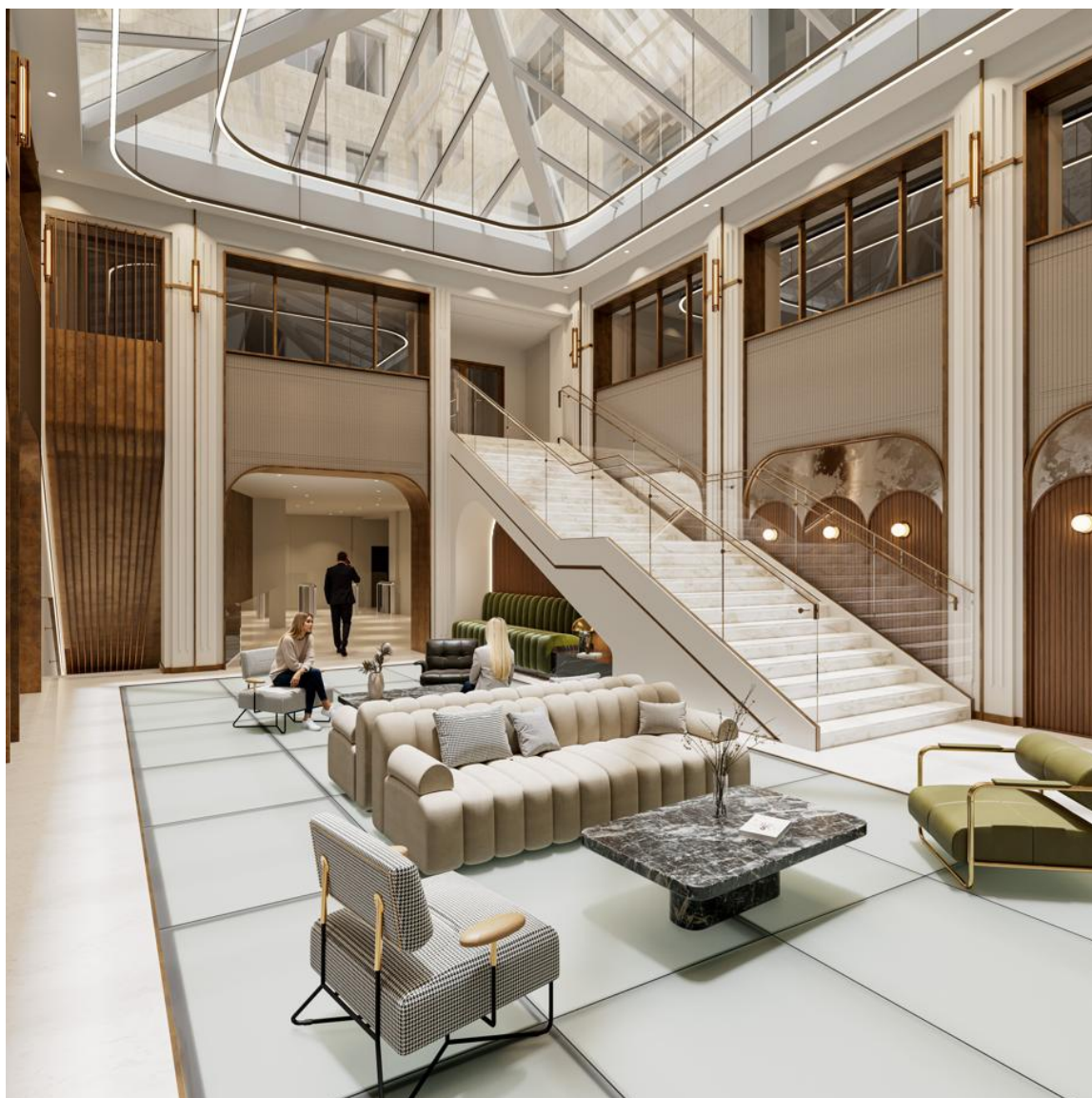
Haussmann Saint-Augustin (perspective) © Studios