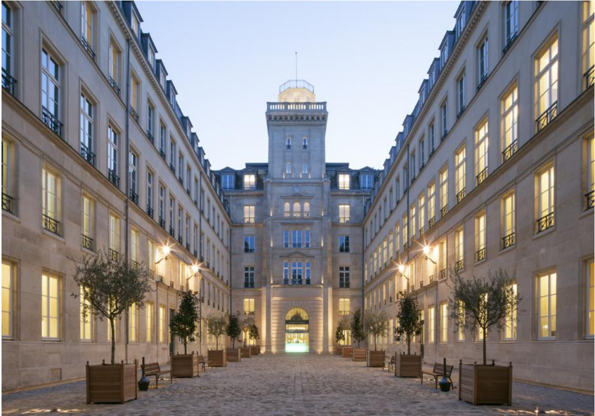
103 Grenelle