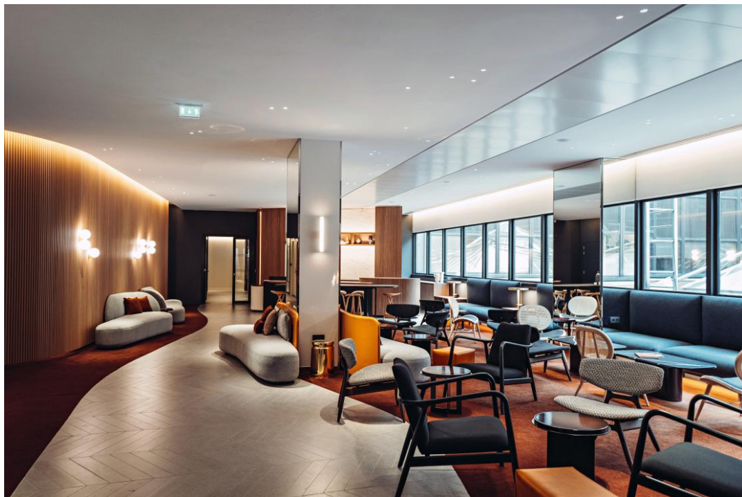
Louvre Saint-Honoré

In the Edouard VII complex, Stream has rolled over its lease on over 700 sq.m., and AFG has taken up 1,100 sq.m. under a 9-year non-cancellable lease, confirming the complex's alignment with market demand.